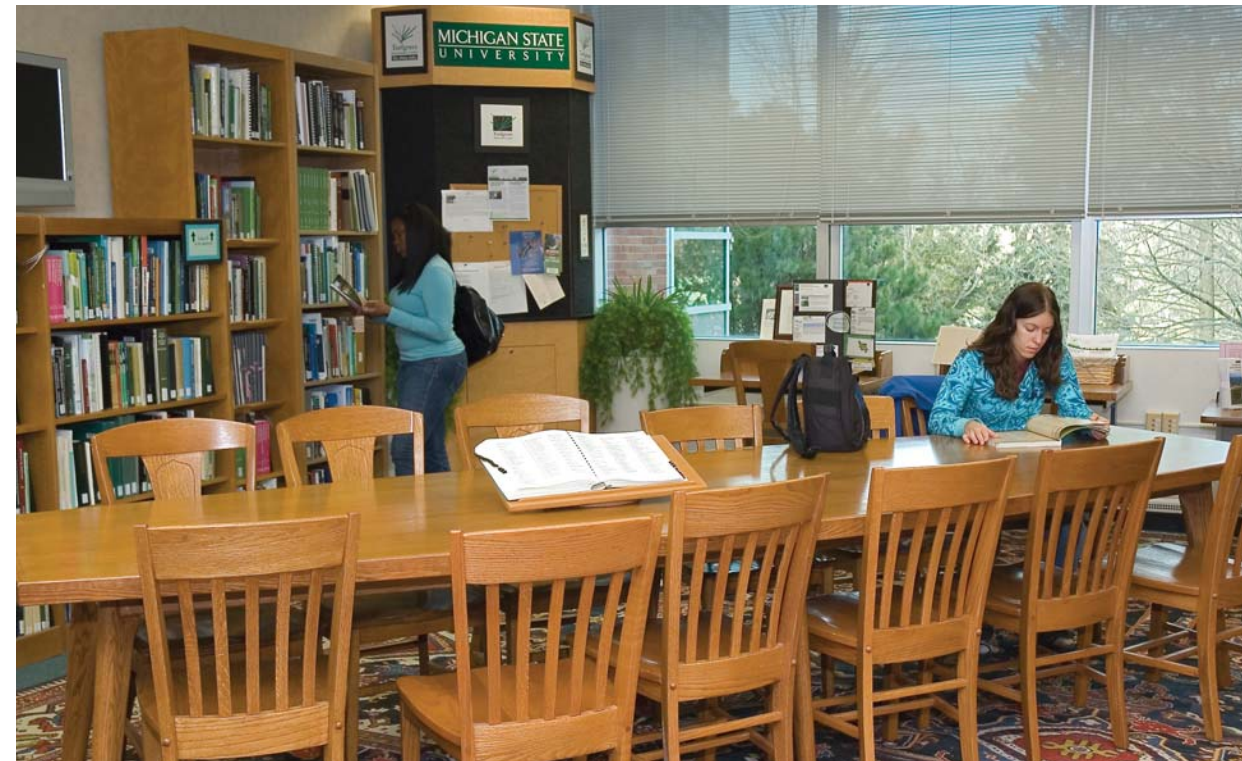
TIC Public Area